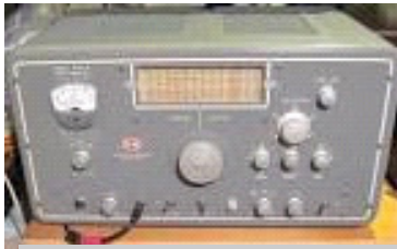
B&W 5100 Transmitter

The B & W 5100 is from the era when all quality ham radio rigs were big and heavy. Collins began the shift to smaller, lighter rigs in 1957 with the introduction of the KWM-1 SSB Transceiver and continued the transition to lighter, smaller high performance equipment with the original S-Line in 1959. The B & W 5100 AM-CW transmitter weighed well over 100 pounds when virtually all quality rigs were very heavy like the Johnson Viking Valiant, Heathkit DX-100 and Collins 32V-3, all over 100 pounds. The 5100 came out in 1954; in